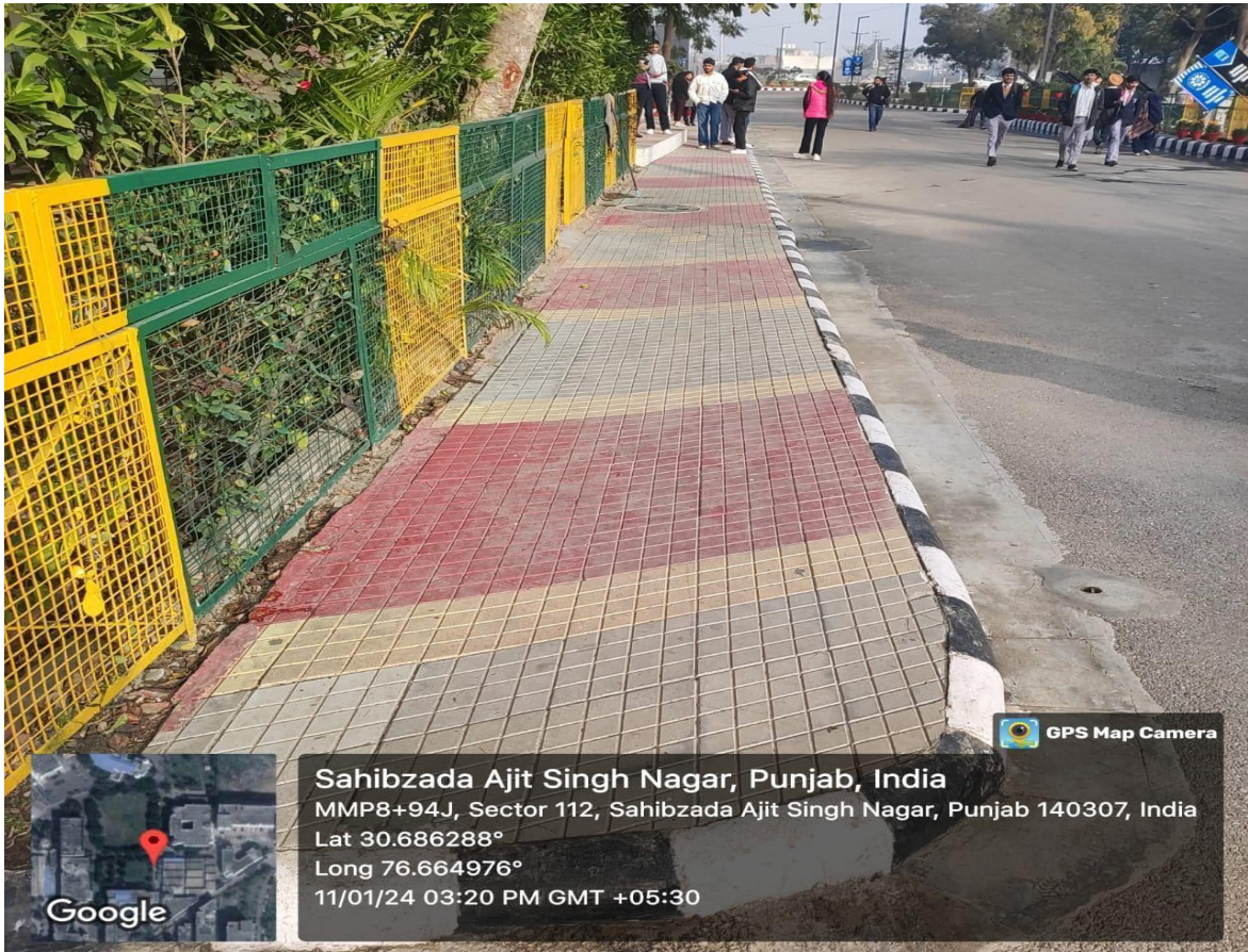
Pedestrian Path in front of Block-6