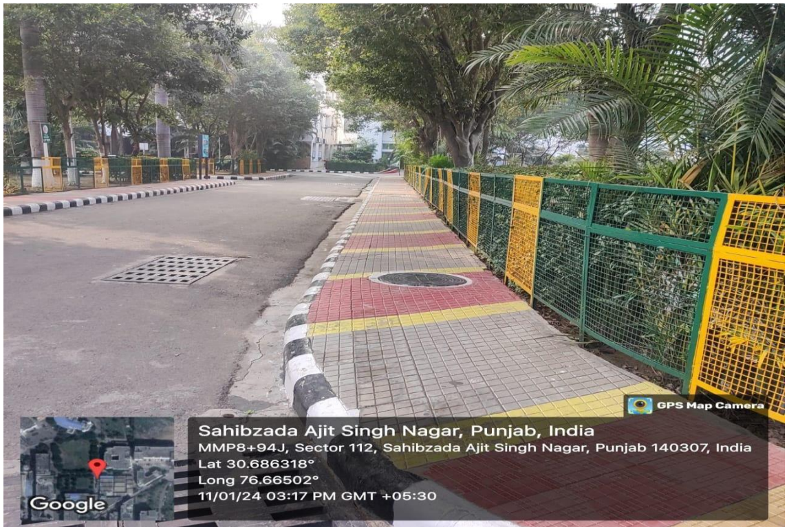
Pedestrian Path in front of Central Park