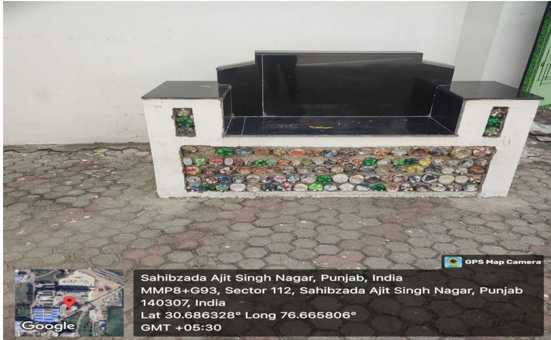
CBSA “The Eco-Minions Club”