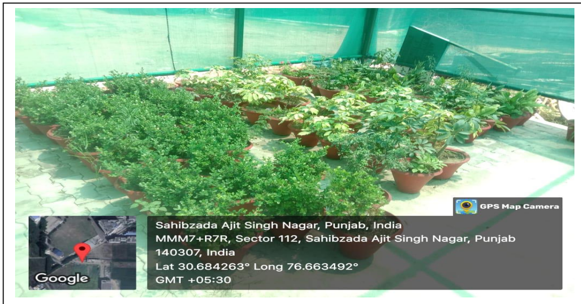
Nursery back side of Parivartan Ground