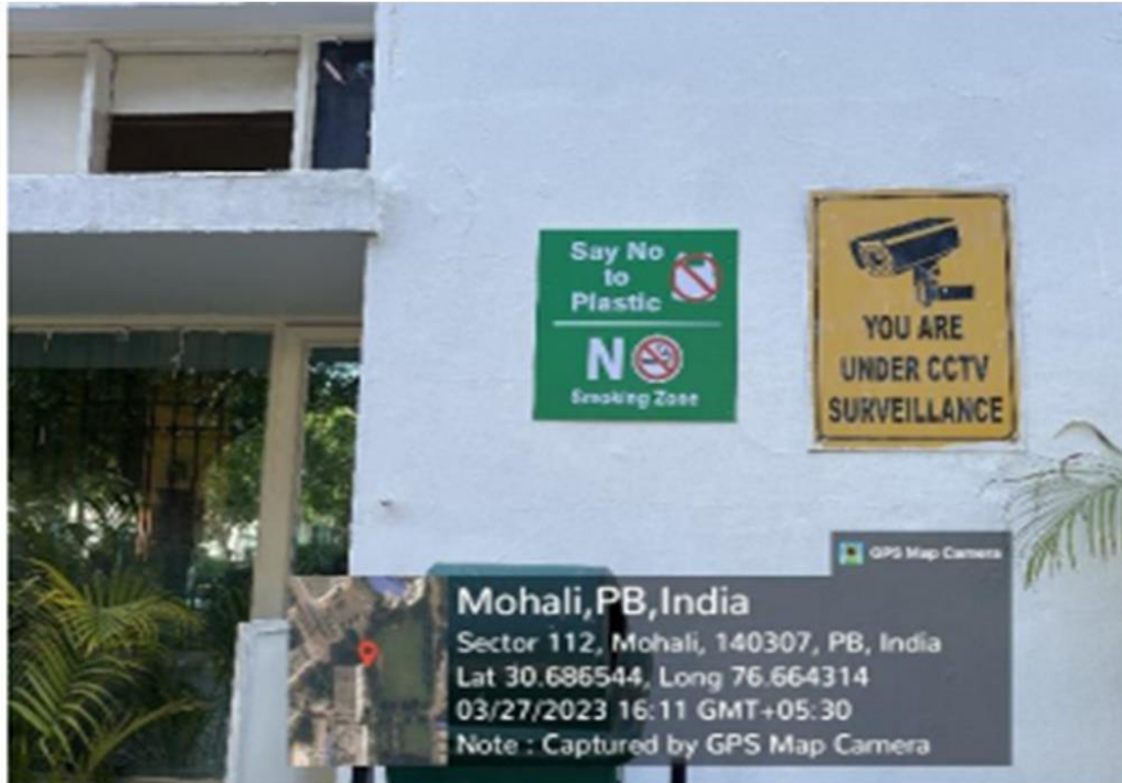
Ban on Use of Plastic