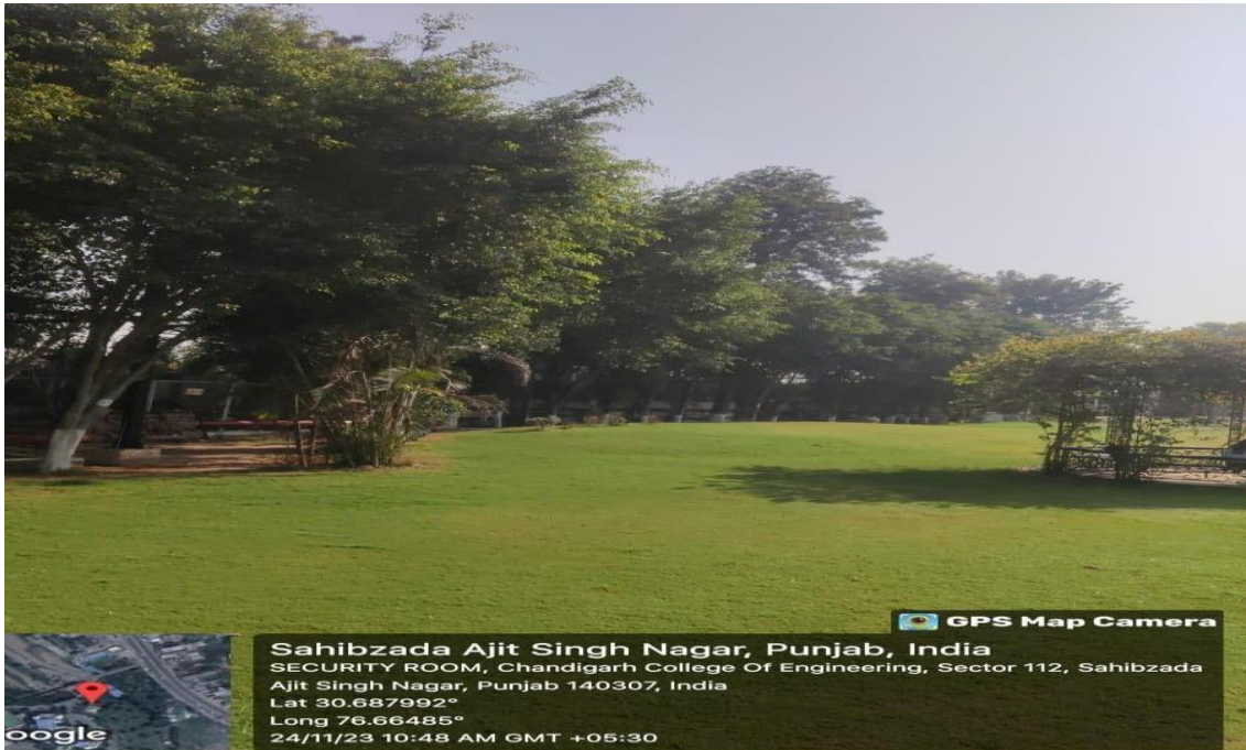
Lawn in Front of Block 2

6. House Nursery: Campus has its own Nursery where plants are grown for transplanting.