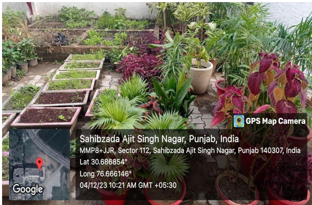
Nursery back side of Parivartan Ground

6. House Nursery: Campus has its own Nursery where plants are grown for transplanting.