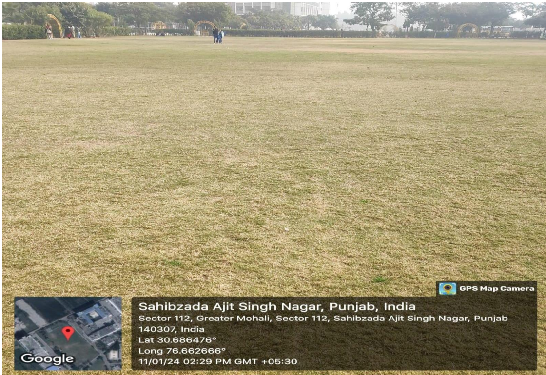
Lawn in Parivartan Ground