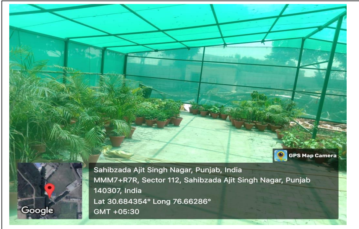
Nursery back side of Parivartan Ground